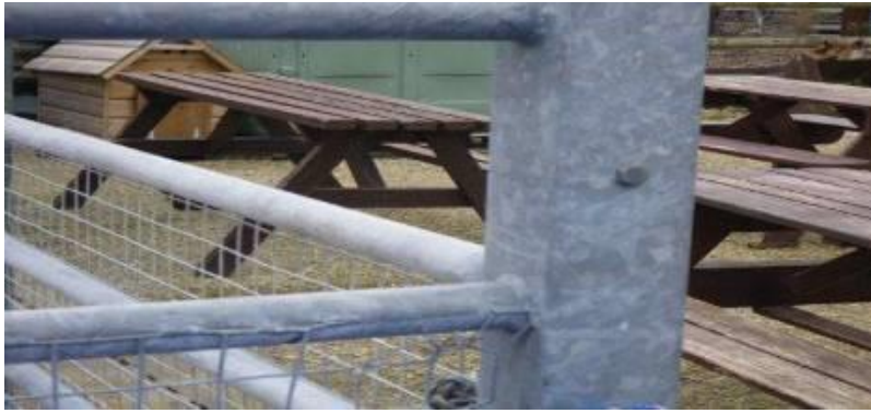
Left: This is not acceptable. Where eating areas are situated next to “animal contact” areas, animal contact must be prevented. This can be achieved by use of double fencing.