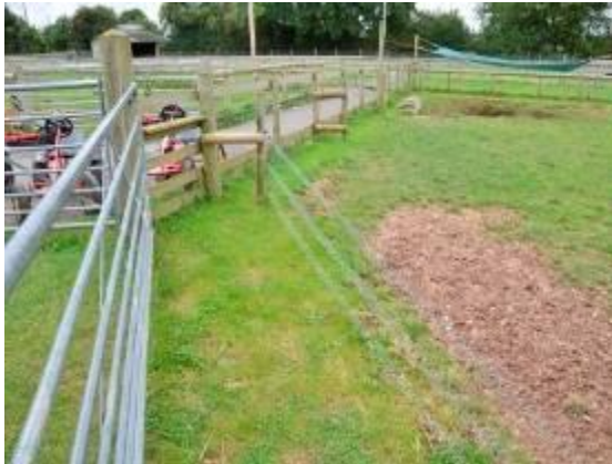
Above: Example of double fencing, stock and electric fences used together.