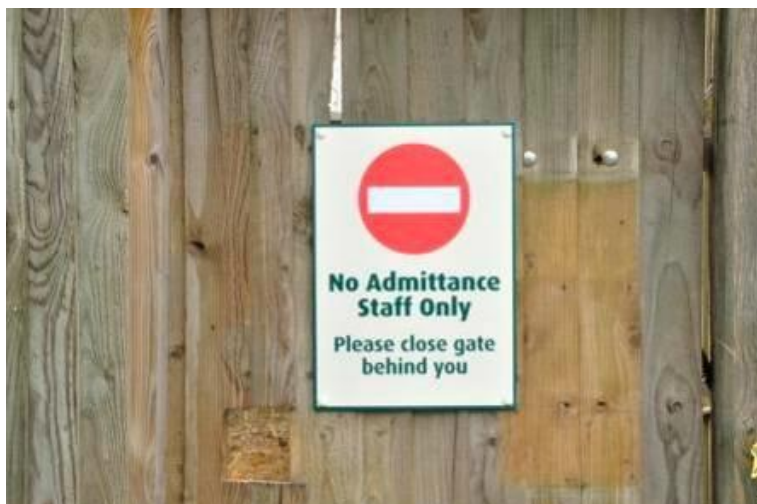
Left: Clear sign on locked gate