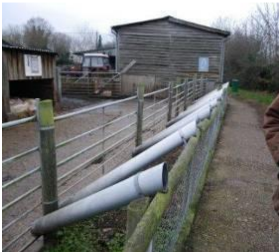
Above: Food is allowed to slide down the pipe into the pen for pigs.

Children can still enjoy feeding animals in “non-contact” areas and “look and see” areas