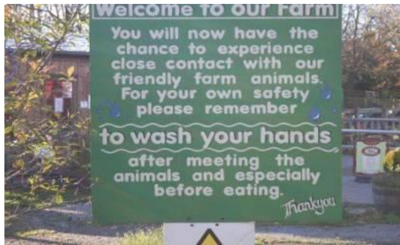
Right: Signage at a farm attraction entrance with a clear message.