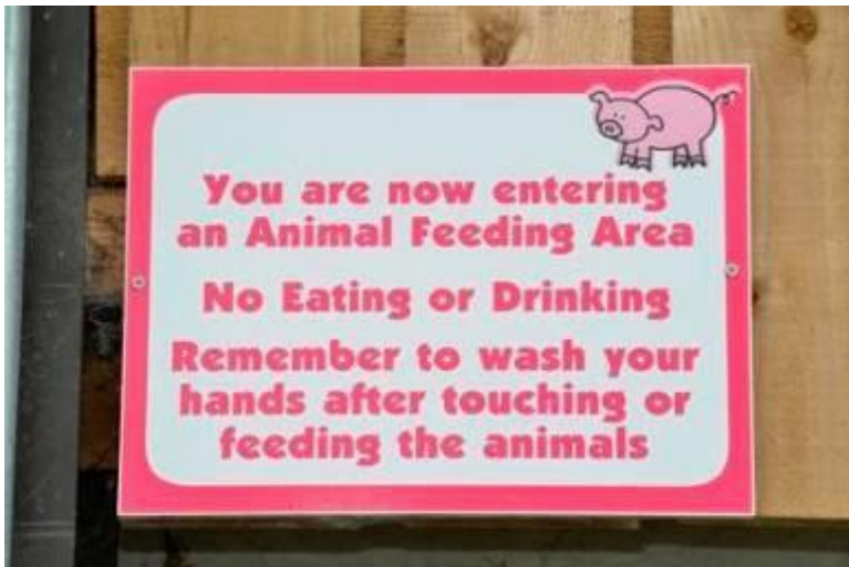
Left: Signage at the entrance to an animal feeding area with a clear message.

Remember signs need to be short and snappy or visitors may not read all the information. Signage must be supplemented by verbal instruction.