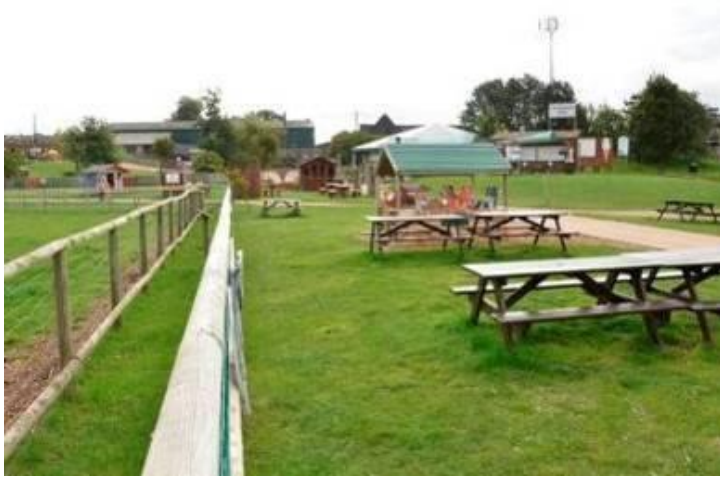
Above: Double fencing to prevent contact with animals. This is especially important near to eating and playing areas.