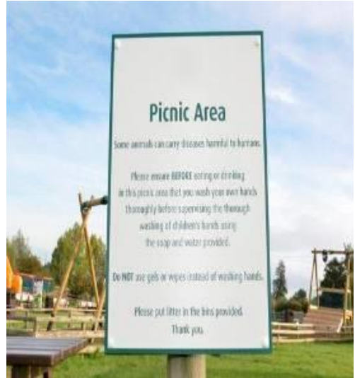
Above: Signs reminding visitors to wash hands before eating or drinking.