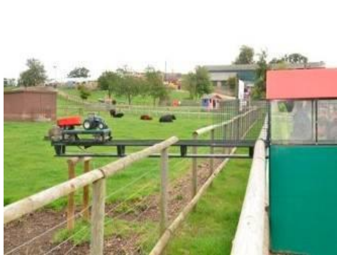
Above: Food is placed in the trailer and by turning the handle the tractor and trailer back out and the food is tipped from the trailer for the cattle.