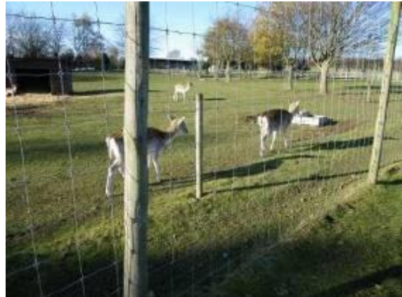
Above: Example of double fencing, high and low stock fences. Visitors can still view the animals safely.

Children can still enjoy feeding animals in “non-contact” areas and “look and see” areas