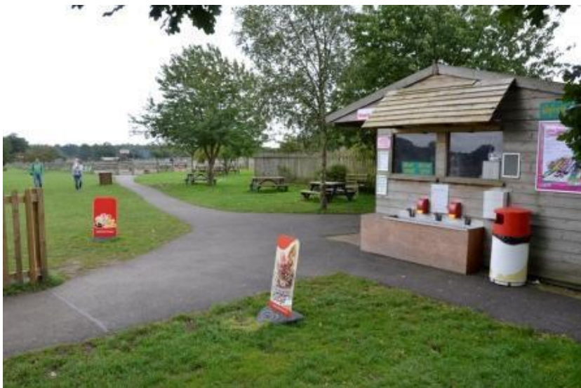
Left: Washing facilities on side of food kiosk