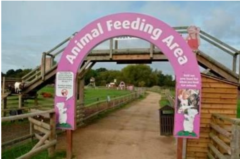
Left: Well signed entrance to animal feeding area