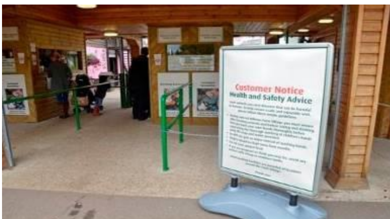
Left: Signage at the entrance to a visitor attraction. Beware that difficult to read text or too much information may put people off properly reading the signs.